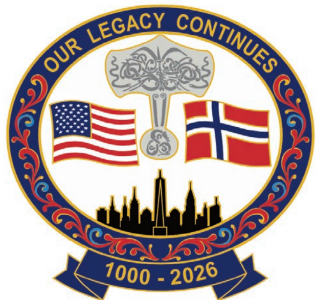
Sneak Peak: Parade Pin 2026